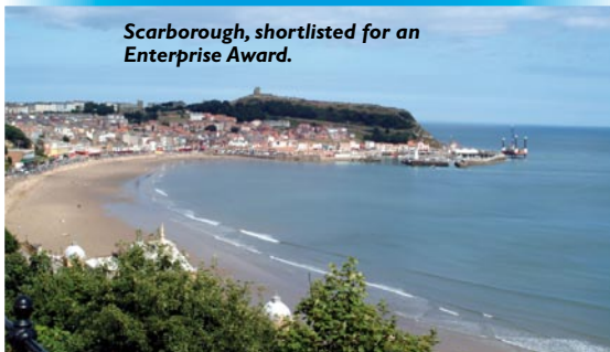
Scarborough, shortlisted for an Enterprise Award.