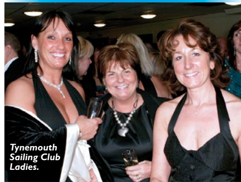
Tynemouth Sailing Club Ladies.